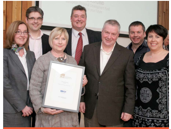
The team picking up a marketing excellence award.